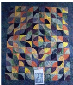
Gary's Eclipse Quilt