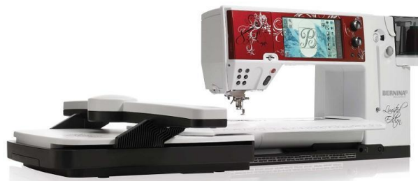
new 830 Limited Edition