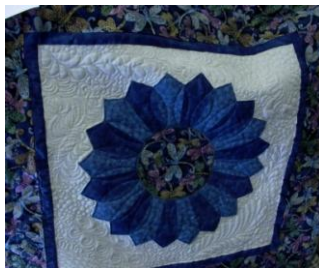
Amanda's Dresden Dragonfly