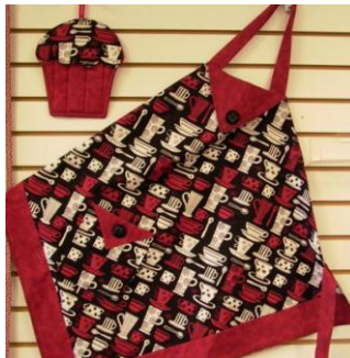
Four Corners apron and Cupcake Mitt